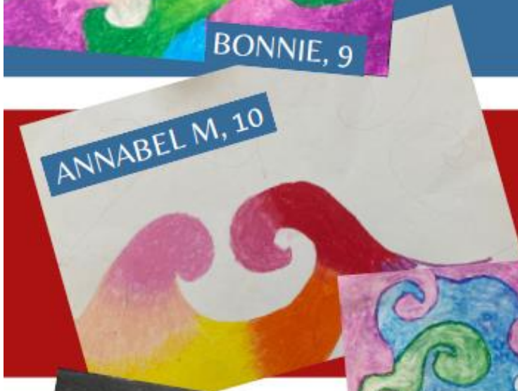
ANNABEL M, 10

MATARIKI INSPIRED ART Here are some of the artworks in progress from Whitireia. Keep an eye out for these when they pop up around school over the next couple of weeks!