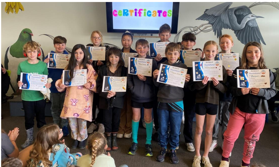
Senior Assembly certificates